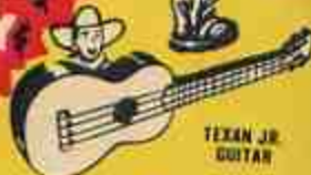
TEXAN JR. GUITAR